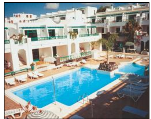
Diamond Las Calas Resort

With superb beaches, safe and warm seas, excellent water sports, and year round sunshine, your Canary Island vacation will be memorable.